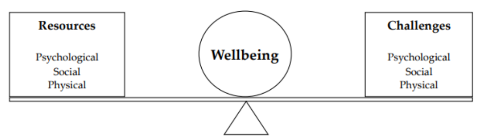
Figure 4. Definition of Wellbeing

Dodge et al's article "The challenge of defining wellbeing" is very useful in this respect<sup>3</sup> and we found it helpful in evaluating whether or not the Caring for Our Wellbeing addresses this as a core focus. Dodge sees "wellbeing" as the balance point between an individual's resource pool and the challenges faced, explained diagrammatically as follows: