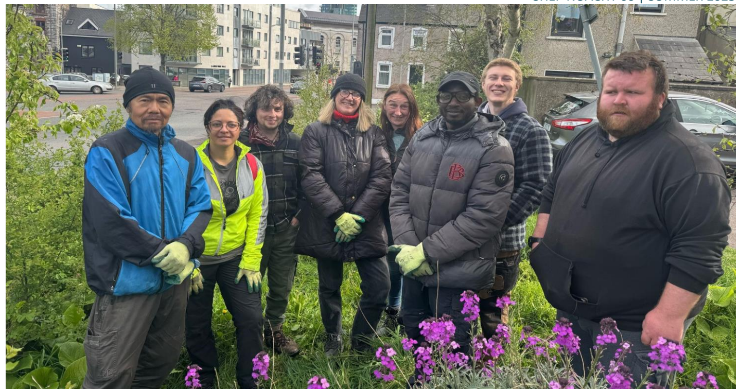
Some of the participants of the SHEP Horticulture LTI at one of their volunteer ourtreach projects – in this case working last month to support Douglas Street Residents.