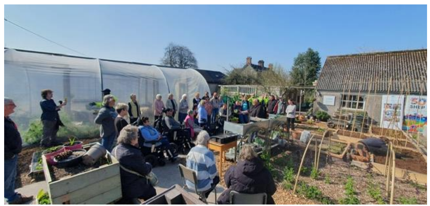
Participants at the 'Cork Life-Long Learning Programme' Event organised by the Ardfoyle Horticulture LTI on April 4th.