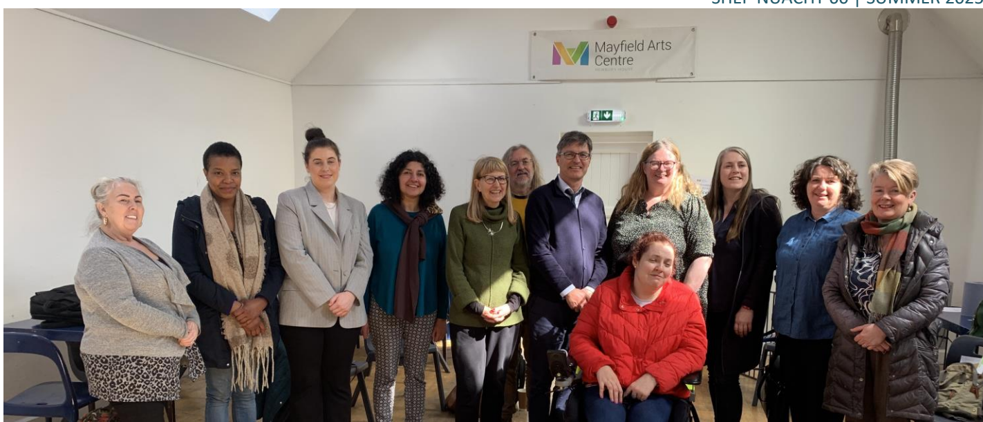
Some of the participants at a recent Cork Community Health Network meeting – held at Newbury House. The CCHN is a network supported by SHEP, Let's Grow Together, NICHE and Newbury House.