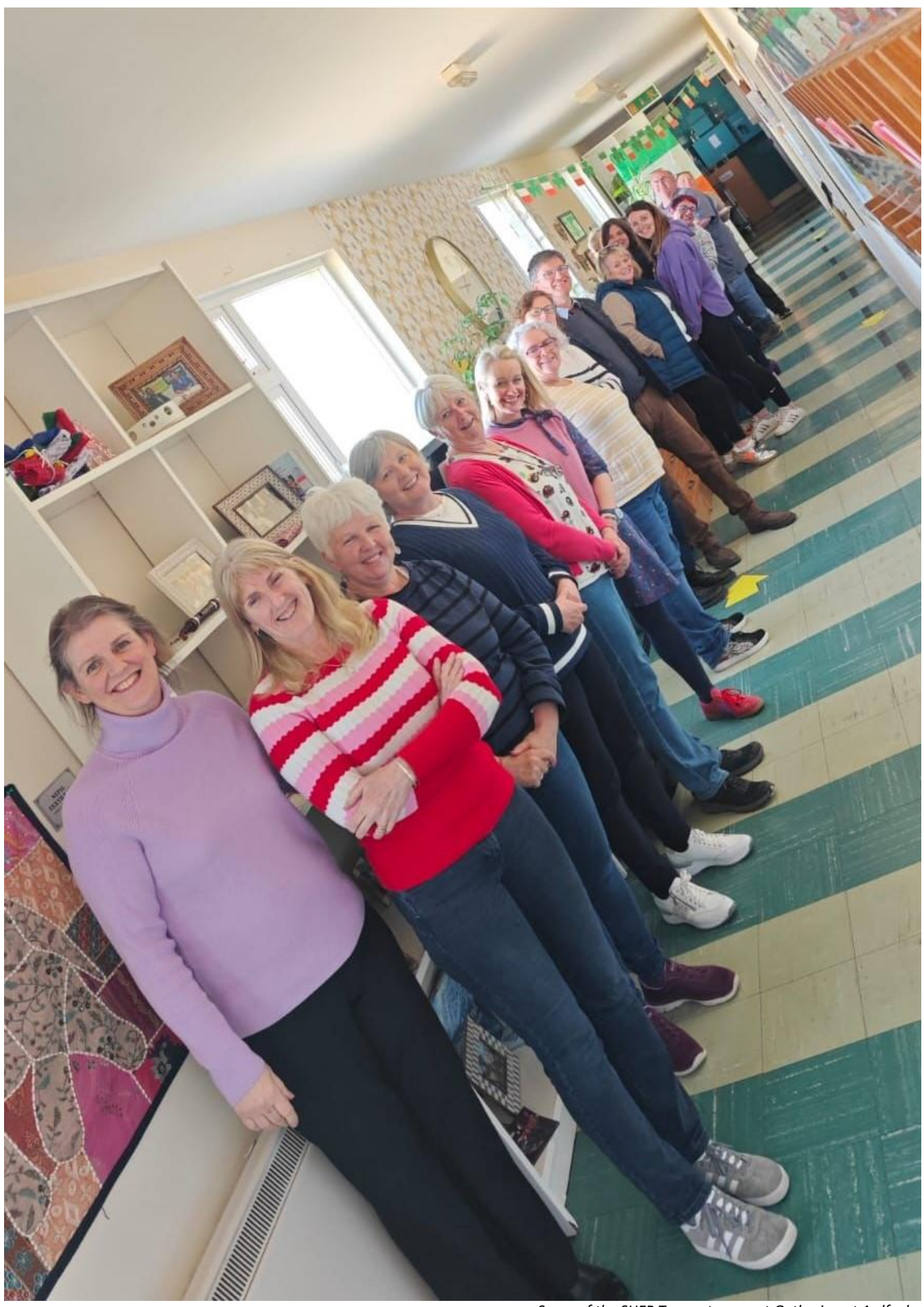
Some of the SHEP Team at a recent Gathering at Ardfoyle.