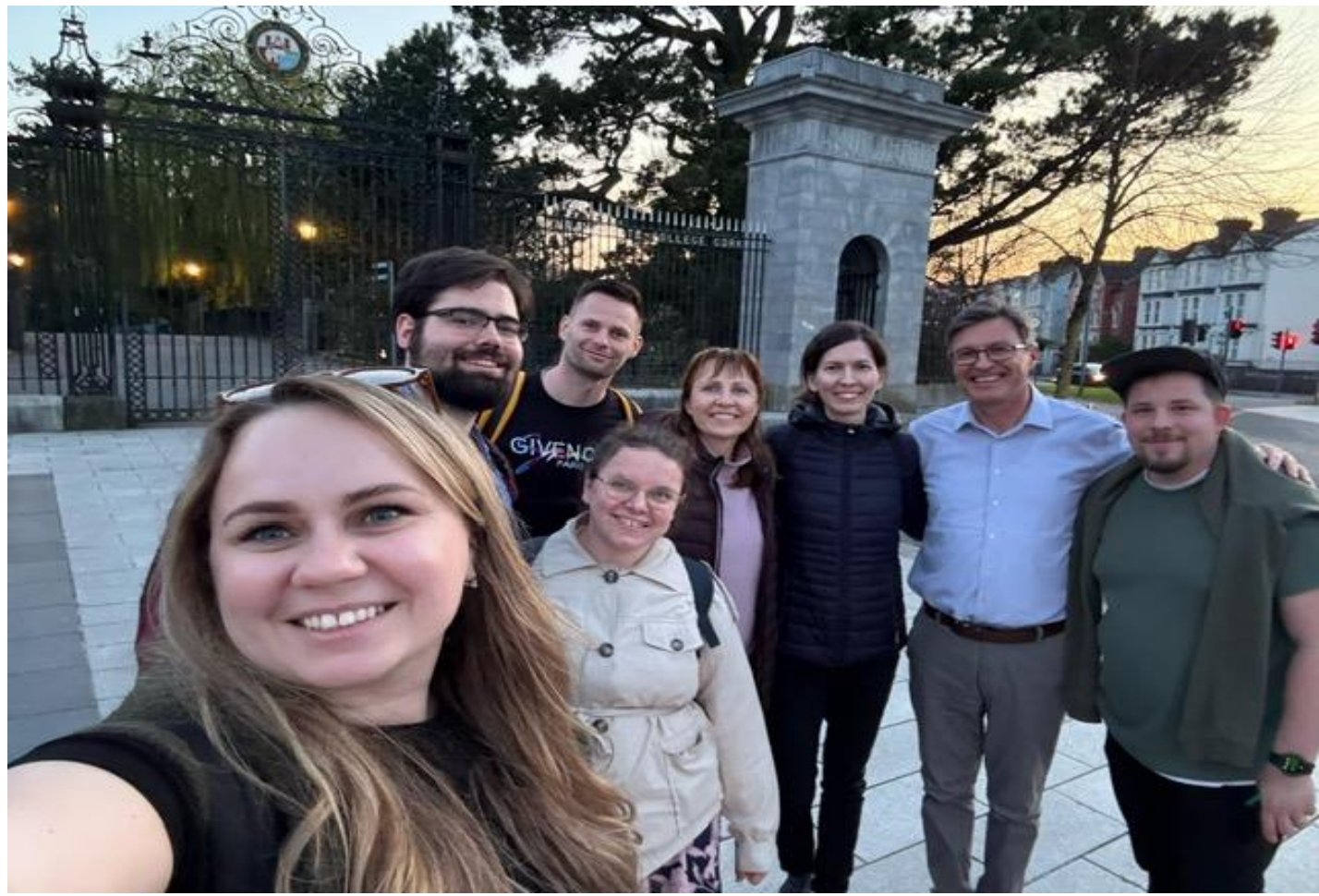
Erasmus Visitors to SHEP in April - outside UCC following a session with the UCC Diploma Class. The group, from Slovakia, came to Cork with a particular interest in exchanging learning about 'Learning Cities'.